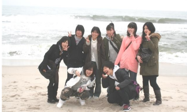
Southern Regional hosts Japanese exchange students from their sister school Sosa Senior High School in Chiba Prefecture, Japan.

Japanese students were hosted by students and teachers of Southern Regional. "Over many years of hosting students, it has always proved to be a very rewarding experience for the hosts and their families. It often produces friend-