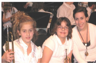
Southern and Stafford students share in a music outreach program.