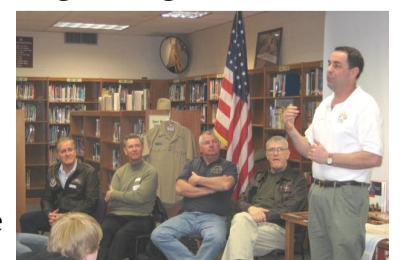
Veterans share their story with Middle School students.